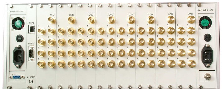
Rear view of chassis

Overview: ETL's model 26128 Modular System offers total flexibility in managing L-band signals. The modular design comprises a chassis with 8 RF slots, two hot swap dual redundant PSUs, and one CPU. Each chassis can hold up to 8 RF modules, which can be hot swapped or hot expanded. This provides excellent resilience and scale ability.