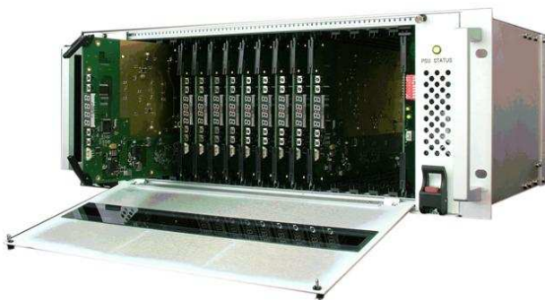
Front view showing hot-swap RF Module