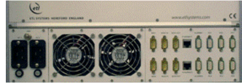
Fig 3 – Expansion & Control Ports

Control & Expansion - Monitoring & Control is via RS232 / 485 or RJ45 ethernet. Serial ports on the rear allow future expansion.