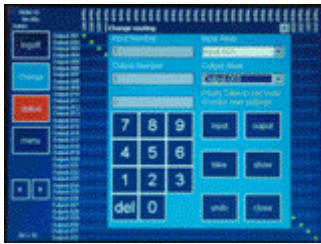
Fig 4 – Routing screen

On board log records all routing changes for each user