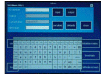
Fig 6 – Setting Aliases

Aliases (10 character) are set on front screen to identify signal sources