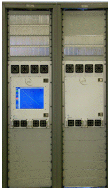
Fig 7 – 256 x 256 Titan IF Matrix System

Splitters and combiners allow Titan modules to be joined