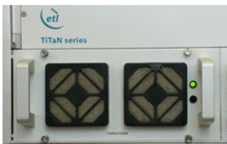
Fig 10 – Hot-swap power supplies