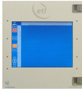
Fig 5 – Touchscreen control

Touchscreen VGA control with security log on for up to 10 users