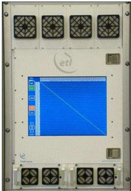
Front View of Model TTN-10-B7B7

128 x 128 signal routing taken to new levels