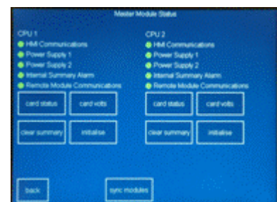
Fig 11 – Touchscreen Monitoring Page

The matrix continuously monitors the conditions of amplifiers, CPUs and PSUs. Any faults are immediately reported through the front panel and remotely. Alarms report the specific faults down to component level.