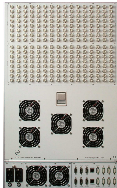
Rear View of Model TTN-10-B7B7

All active RF and CPU cards are designed to be hot-swapped from front and rear without removing RF cables or connectors.