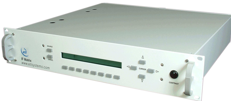
Front view of Model M0808D2UFI-B7B7-A

With Local & Remote Control (via RJ45 Ethernet Port and RS232/422/485 Serial Port)