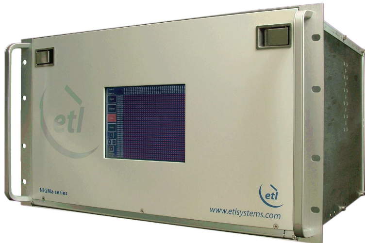
Front View of Model NGM-29 showing touchscreen VGA

32 x 32 Broadband (50-1000MHz) signal routing