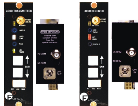
Transmitter and Receiver Front and Rear Views