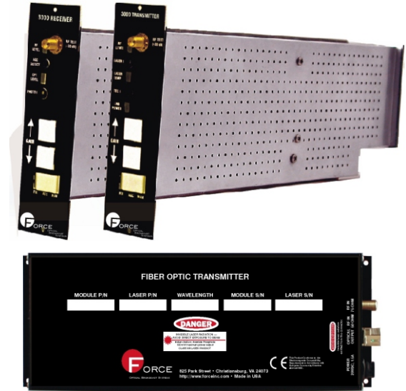
3RU and Stand-alone Modules